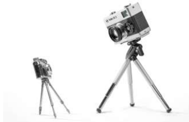
"Intimidation" by Ian Preston